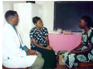
A VCT training session on couple counselling

CHAK facilitates capacity building in member health units by conducting short trainings, seminars, workshops, and providing updates. In addition, the Secretariat coordinates formal training programs. These include: Internship training for doctors and other professionals; nurses training at nursing schools at 8 CHAK Hospitals; postgraduate training for doctors in family medicine conducted through the Institute of Family Medicine (INFAMED) in collaboration with Moi University.