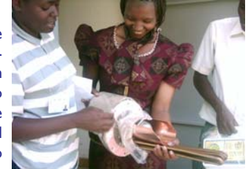
Examining new equipment at the Spare Parts Store

A Central Purchasing Spare Parts Store at the CHAK Secretariat was established in April 2003. The Store aims to ensure regular and reliable supply of high quality medical equipment and spare parts to health facilities.